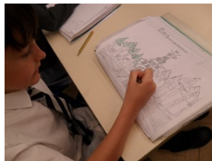
A sketch of an isle from 'Oliver and the Seawigs