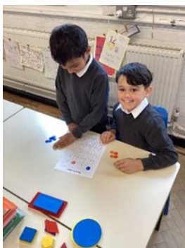
Year 3 playing 'Three in a Row - A shapes game

In Maths, Year 3 have been concentrating on Angles and Shape and Measure, and Year 4 on Shape and Symmetry.